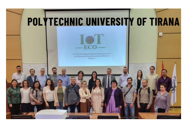
Dates: May 24th - 26th, 2023 Venue: Polytechnic University of Tirana, "Silvano Pedrollo" Room, Tirana, Albania

Our valued Associate Partner, Innovation Fund of Montenegro is strongly supporting project activities in Montenegro with dissemination and promotion with their vision on developing various support instruments to effectively implement the Government's innovation policy, which is based on the concept of smart specialization, and intended for development of innovative entrepreneurship as a generator of sustainable economic development. We build a stimulating environment for faster growth and development of small and medium innovative entrepreneurship and increase competitiveness of the Montenegrin economy with quality grant programs, created in accordance with the identified needs.